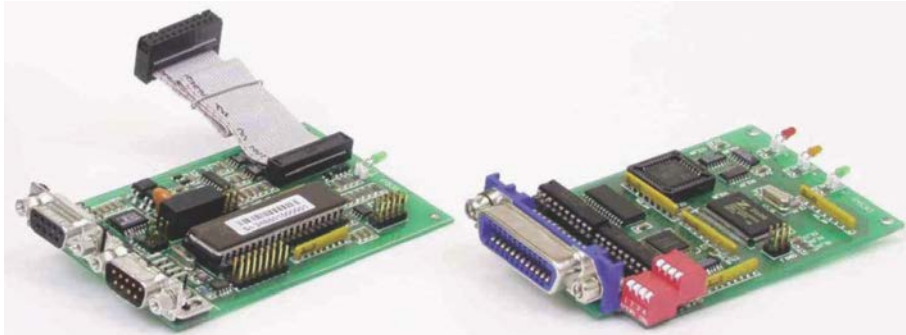
Card for inserting in power supply