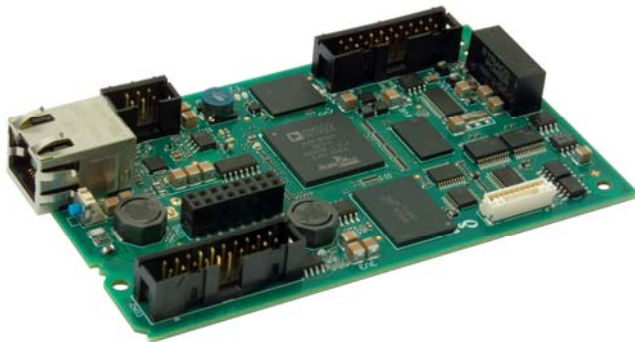
Card for inserting in power supply